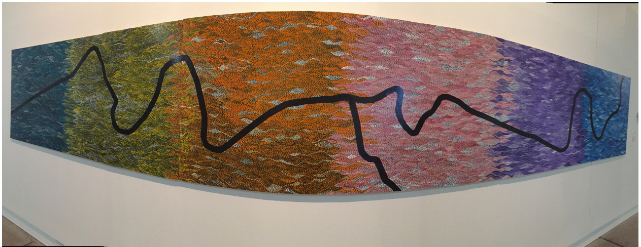
'Wabu' hangs in the multi purpose hall at Red Bend Catholic College.